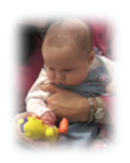
lan, 5 months